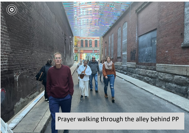
Prayer walking through the alley behind PP

We will continue these Jericho Marches around PP until those spiritual walls of darkness come crashing down... in God's time!