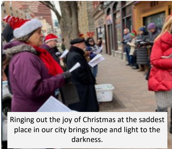
Ringling out the joy of Christmas at the saddest place in our city brings hope and light to the darkness.